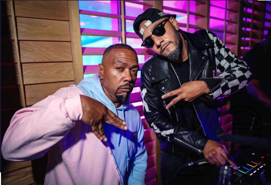
Timbaland and Swizz Beatz, pictured at the Basement Miami 4th Year Anniversary Party in 2018

Streamed on Instagram live, Verzuz serves as a celebration that honours the roots of hip-hop, whilst championing iconic past, present and future pioneers of the genre – from DJs, singers and songwriters, to rappers, producers, performers and everyone in between.